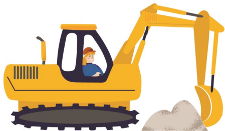
Exhibit in the trade show hall, provide a demonstration of your products or technology, give a technical presentation; there are many opportunities to showcase your products.

This year we will be setting aside a presentation room where our exhibitors can provide live product demonstrations if they choose to do so. Helping the onsite wastewater community understand how components work and how to troubleshoot problems is always appreciated.